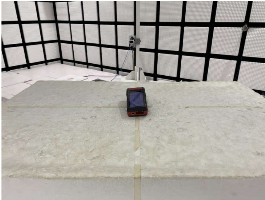
Radiated spurious emission Test Setup-3(Above 18GHz)