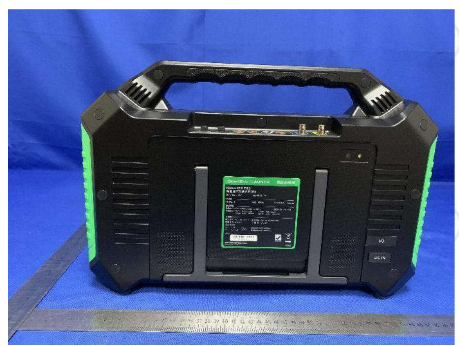
View of Product-9