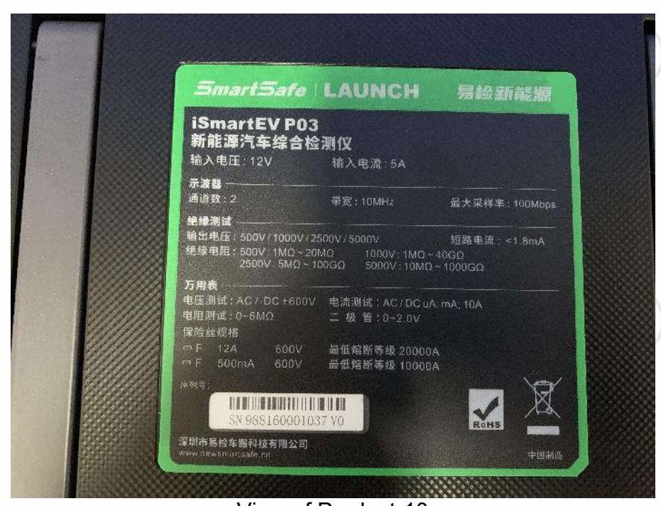
View of Product-10