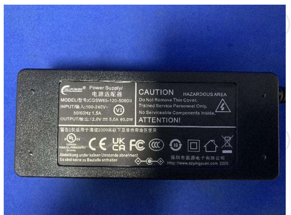
View of Product-13