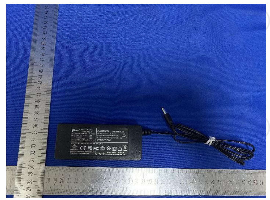
View of Product-12