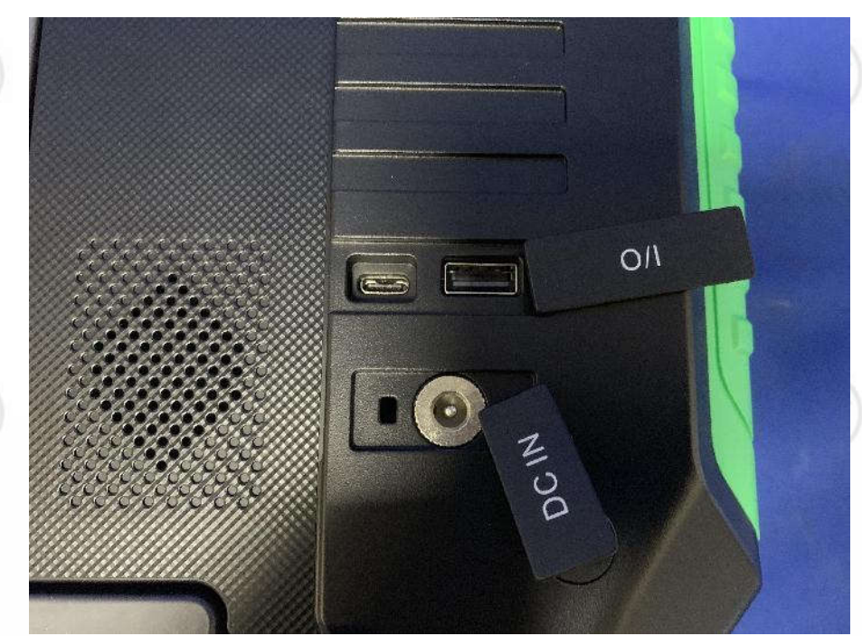
View of Product-11

Page 39 of 52 Report No.: EED32O81503001