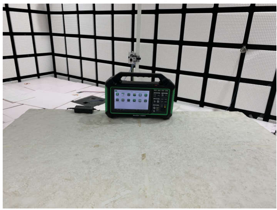
Radiated spurious emission Test Setup-3(Above 18GHz)

Report No.: EED32O81503004 Page 55 of 57