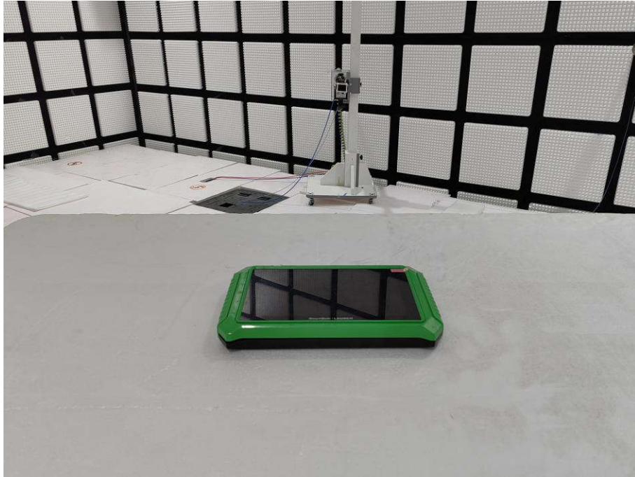
Radiated spurious emission Test Setup-3(Above 18GHz)