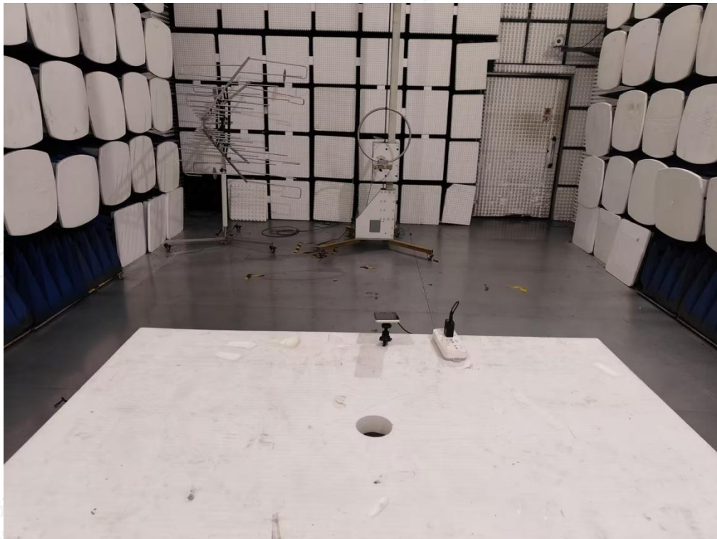
Radiated Emission below 30MHz-AC adapter charge mode