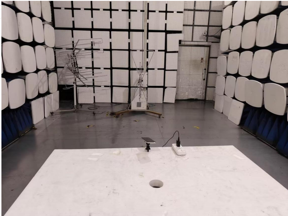
Radiated Emission below 1GHz-AC adapter charge mode