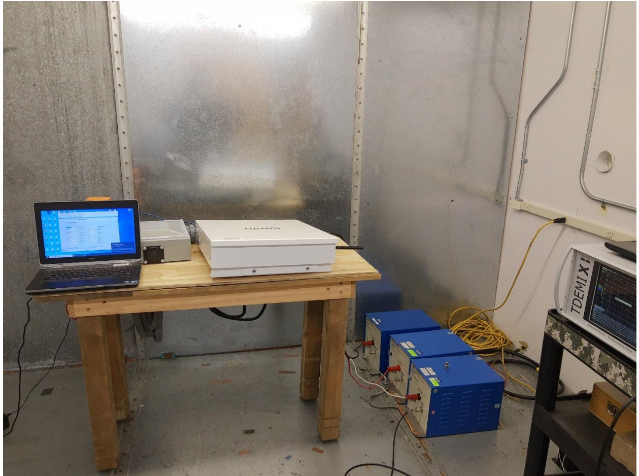
Figure 1: CEV Setup