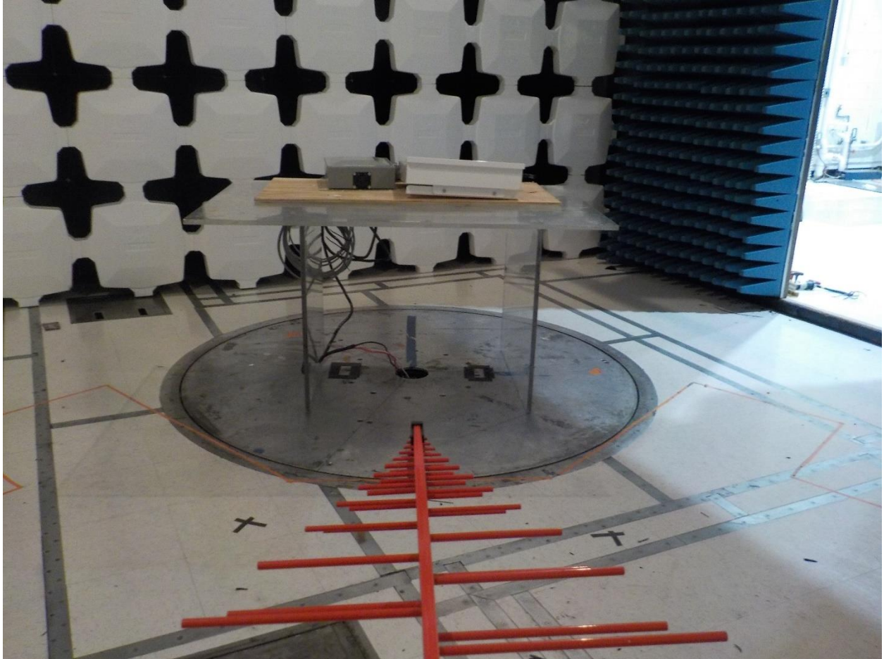
Figure 2: REE Setup (30MHz-1GHz)