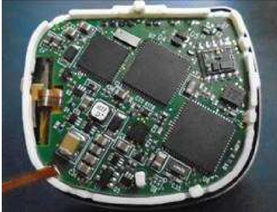
Internal Picture 1: PCB layout of the Optimizer Smart Mini in cannister during production, prior to header attachment