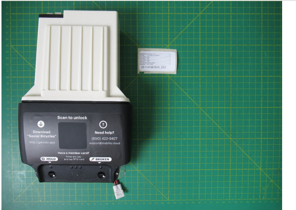
Photograph 1: EUT Top view