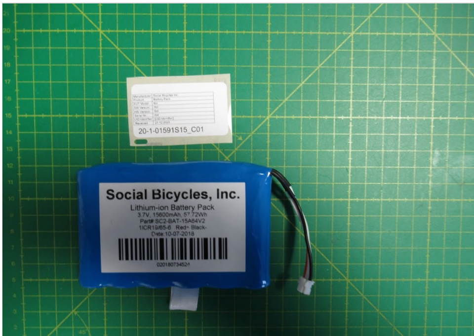
Photograph 4: AE2_Front side view