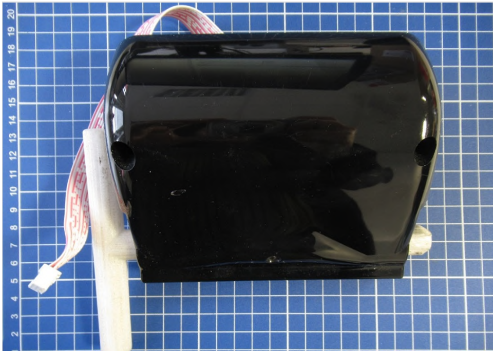
Photograph 3: AE1_Front side view