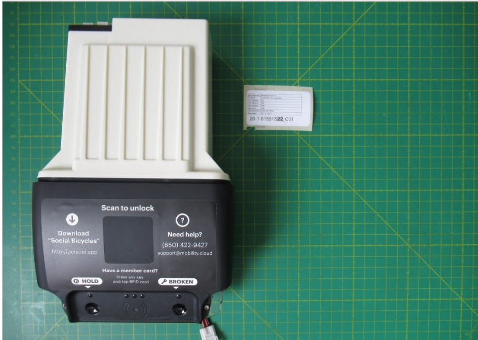
Photograph 1: EUT 1_Front side view