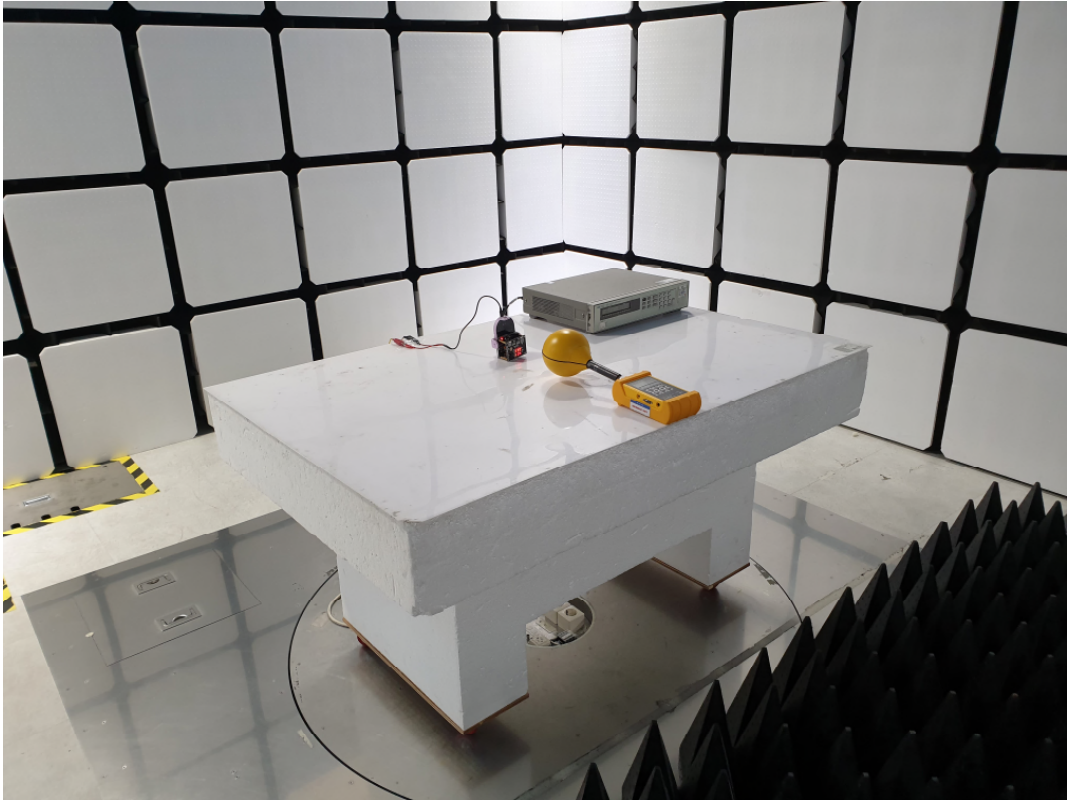
Measurement set-up (H-field)