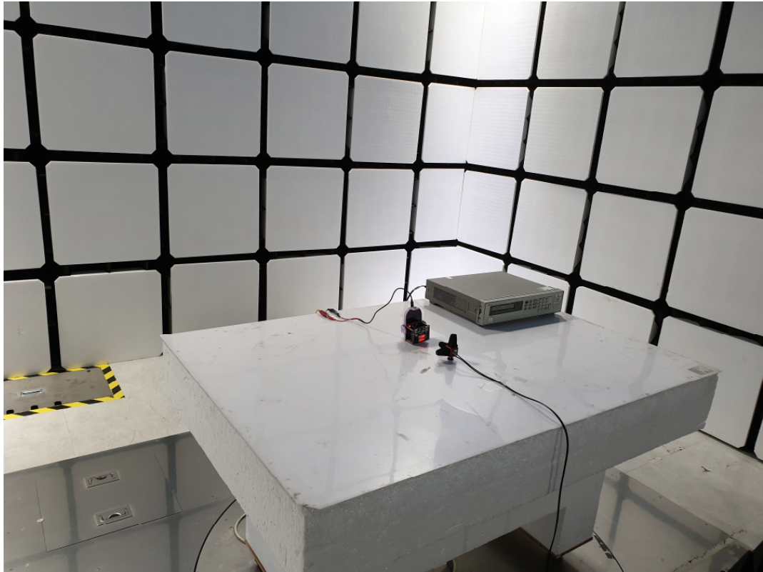
Measurement set-up (E-field)