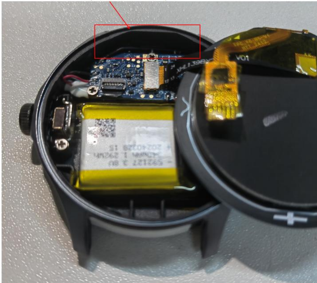
Antenna placement layout