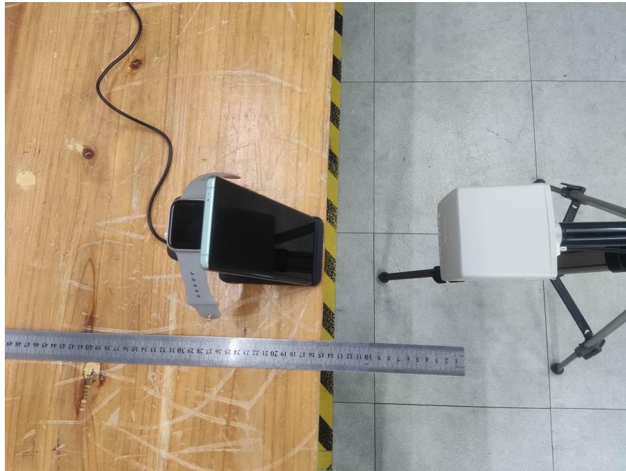
Test Position A-15cm from the edge of EUT to the geometric center of the probe