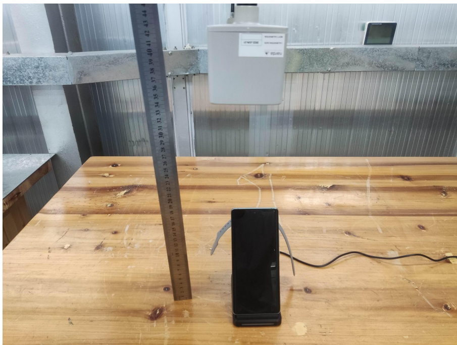
Test Position E-20cm from the edge of EUT to the geometric center of the probe