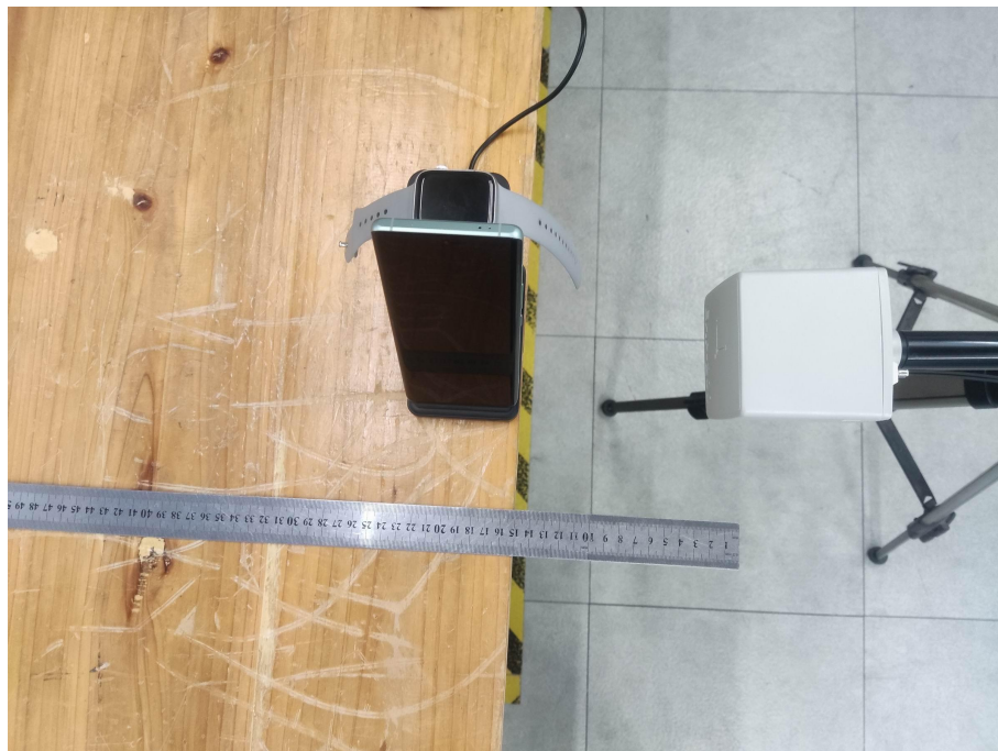
Test Position D-15cm from the edge of EUT to the geometric center of the probe