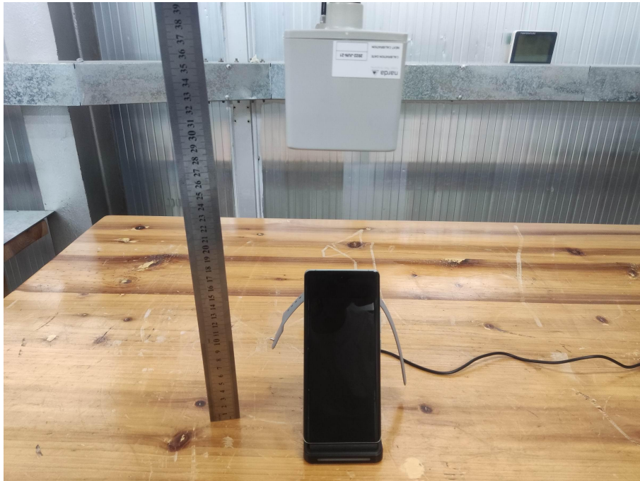
Test Position E-15cm from the edge of EUT to the geometric center of the probe