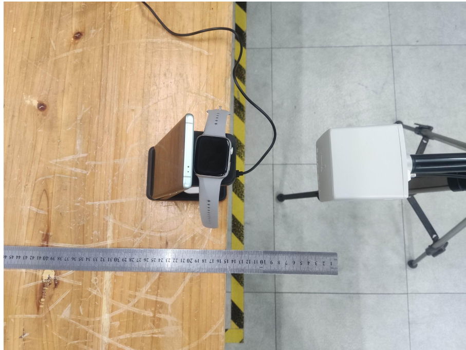
Test Position C-15cm from the edge of EUT to the geometric center of the probe