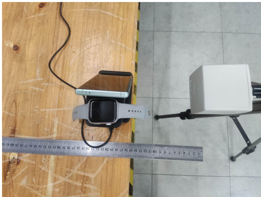
Test Position B-15cm from the edge of EUT to the geometric center of the probe