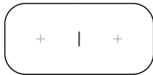
2-in-1 wireless charging pad