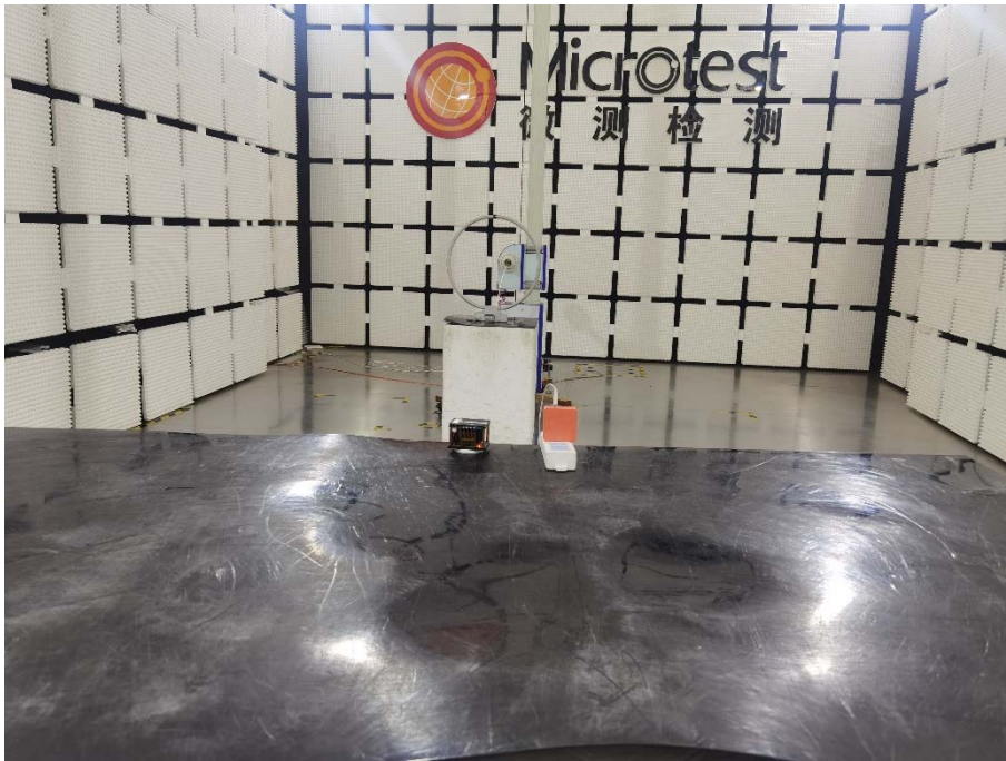
Radiated emissions –Below 1 GHz