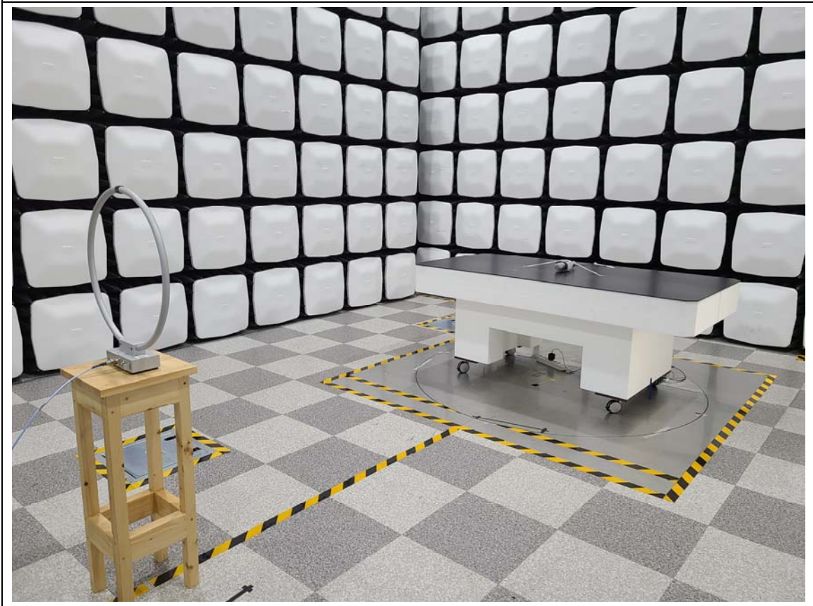
Below 30 MHz