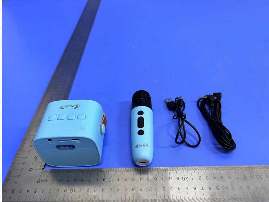
Photo 2 Appearance of EUT