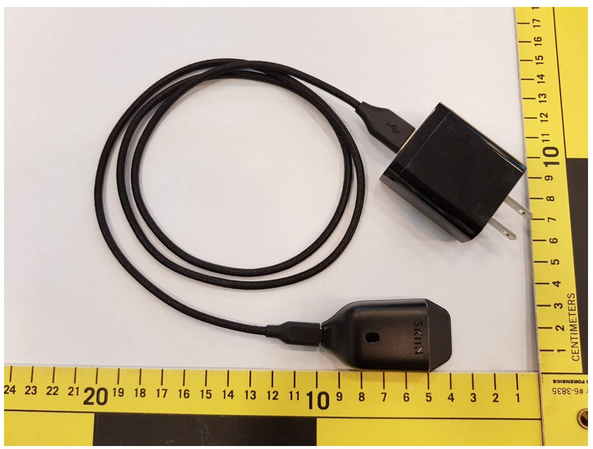
Figure 2 – EUT Charger