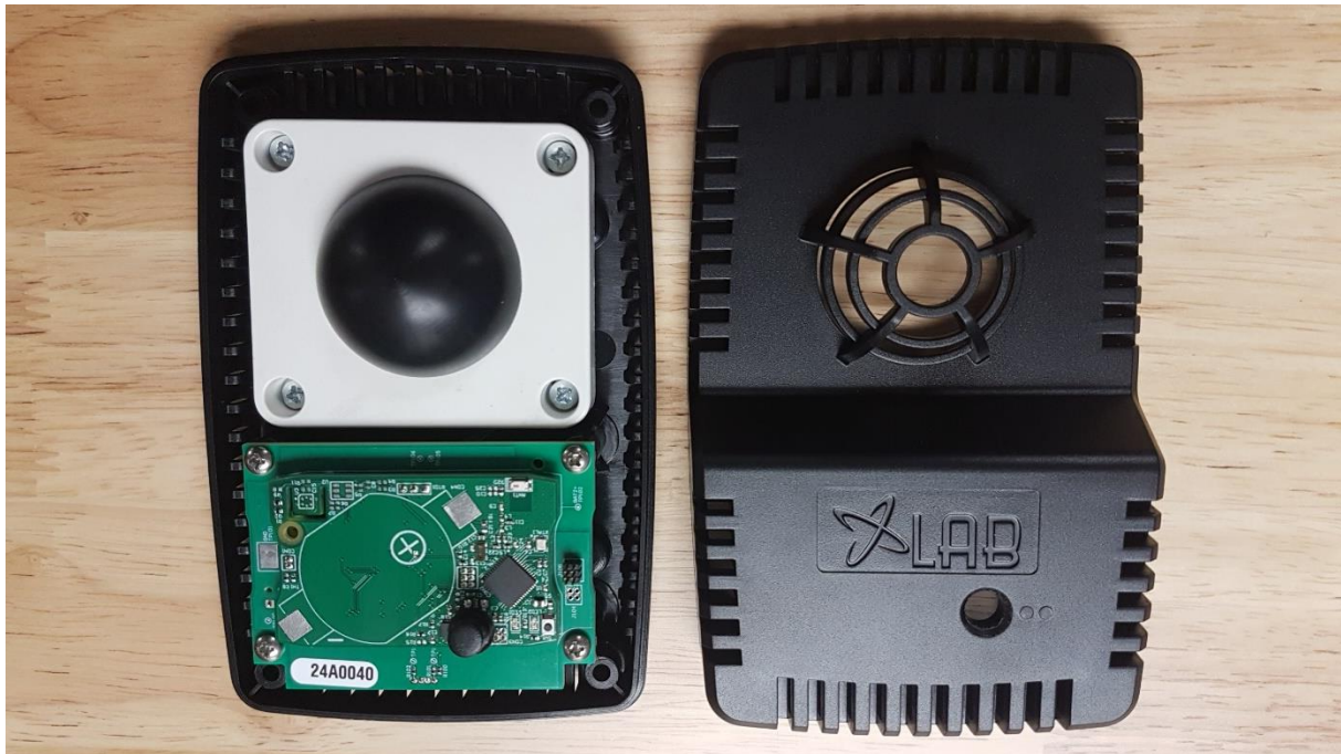
Top Enclosure Removed