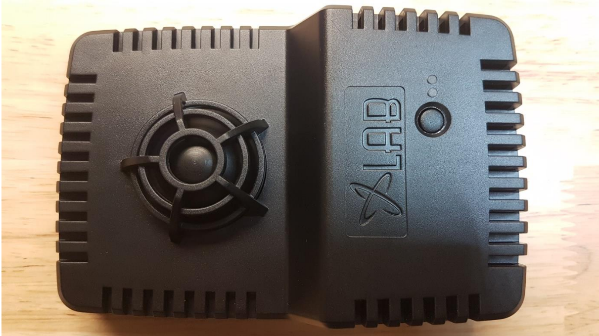
Assembled Enclosure Top