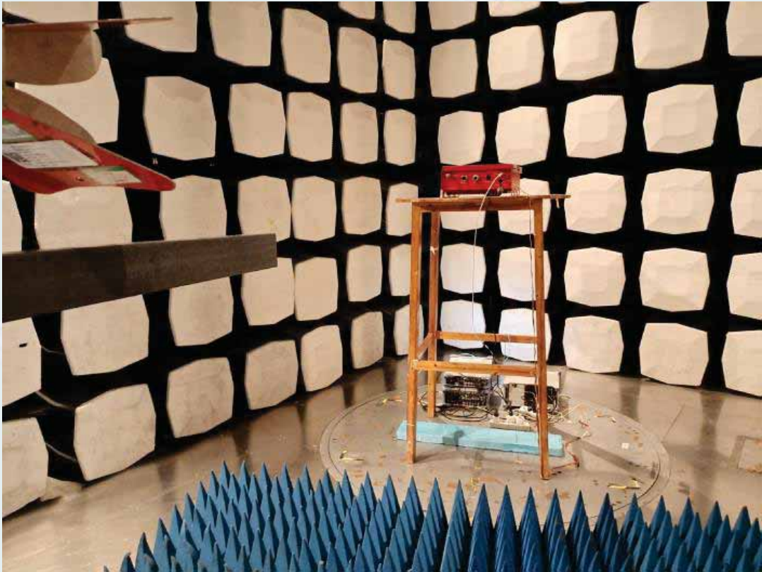
Radiated spurious emissions—Above 1GHz