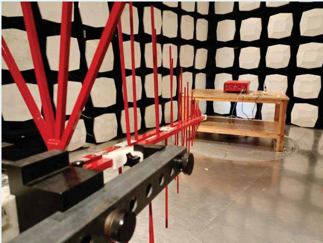
Radiated spurious emissions—Below 1GHz