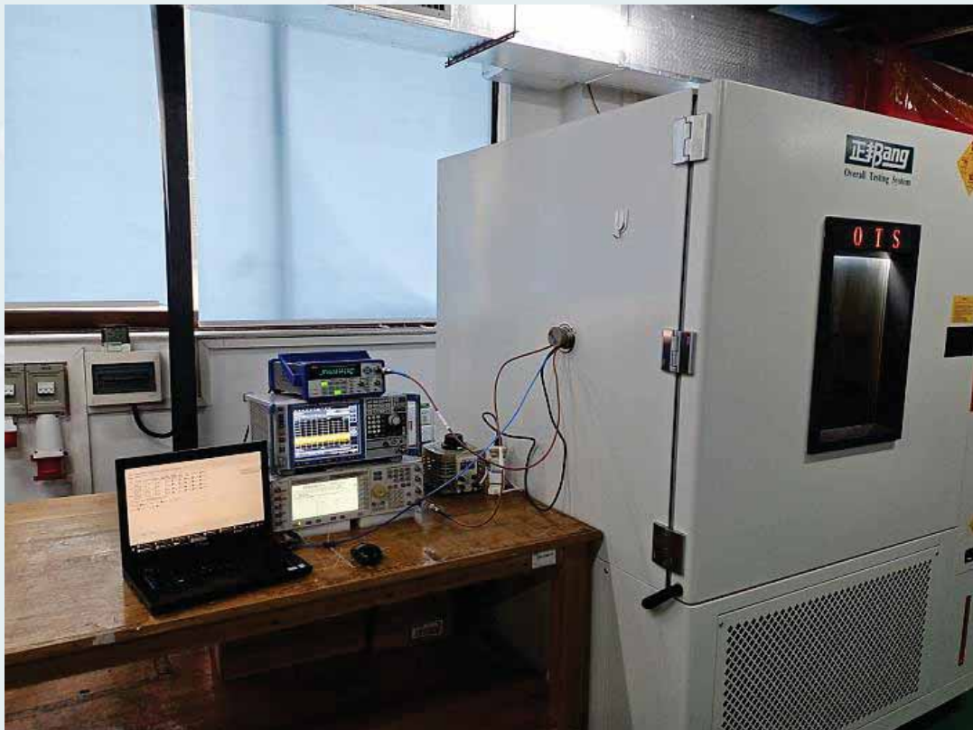
Temperature change test-1