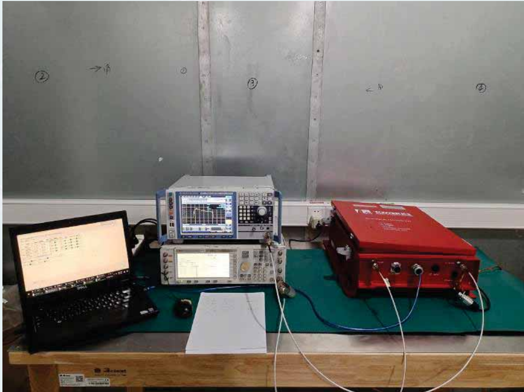
Normal temperature test scenario