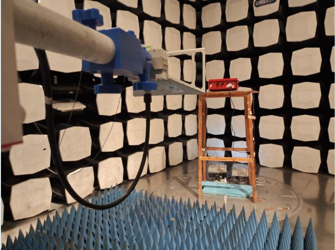
Radiated spurious emissions—Above 1GHz