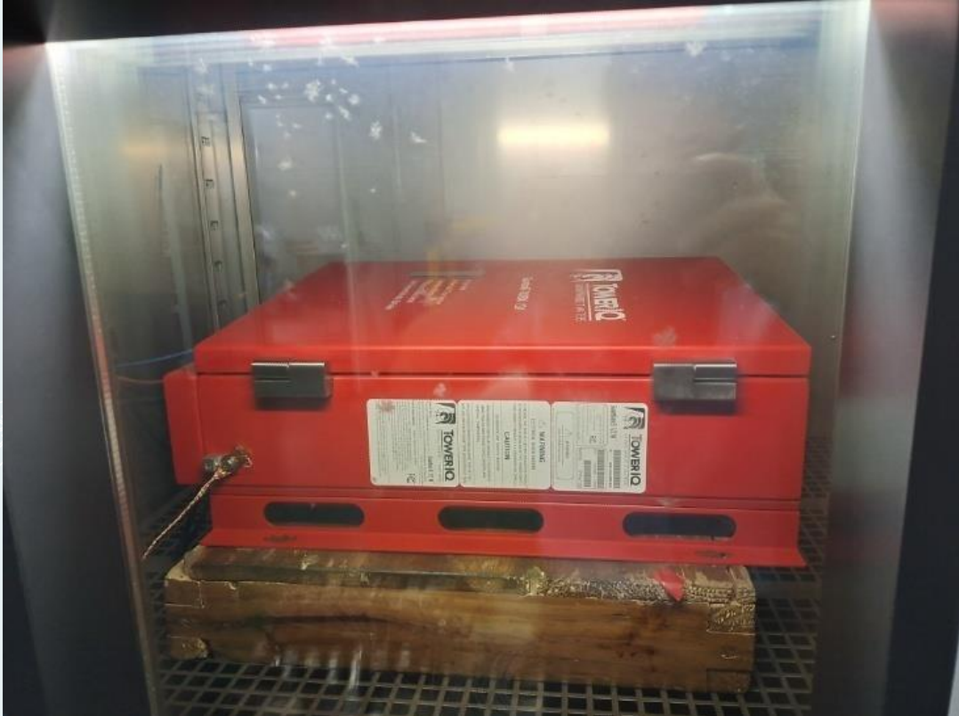
Temperature change test-2