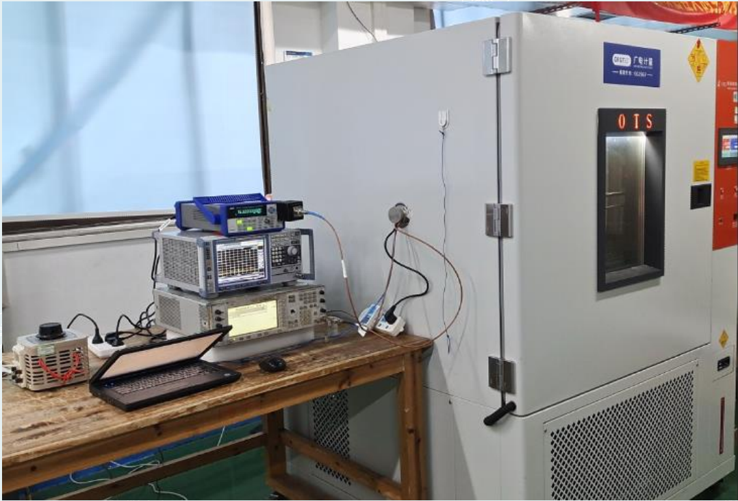
Temperature change test-1