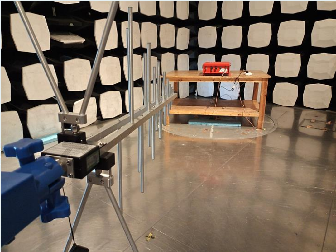
Radiated spurious emissions—Below 1GHz