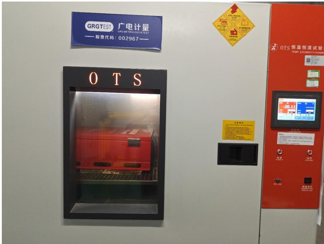
Temperature change test-2