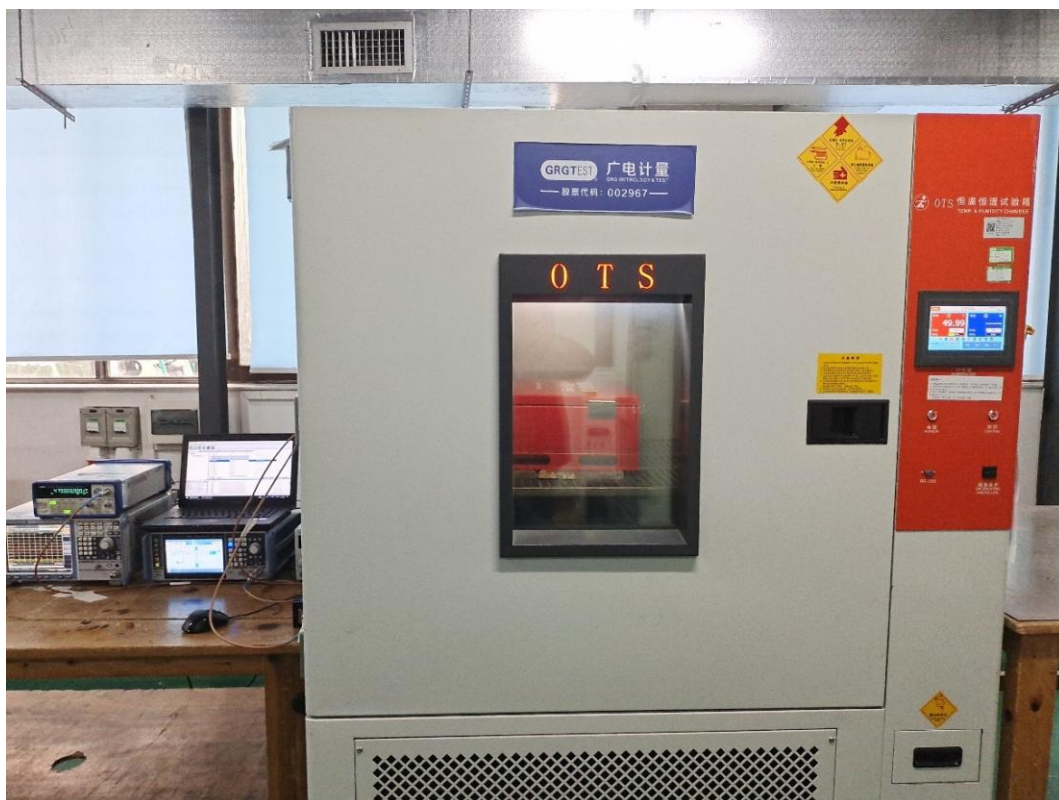
Temperature change test-1