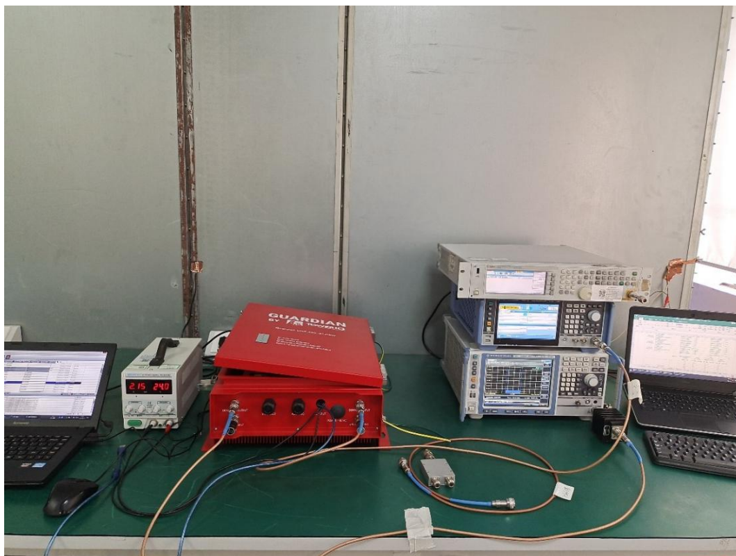
Normal temperature test scenario