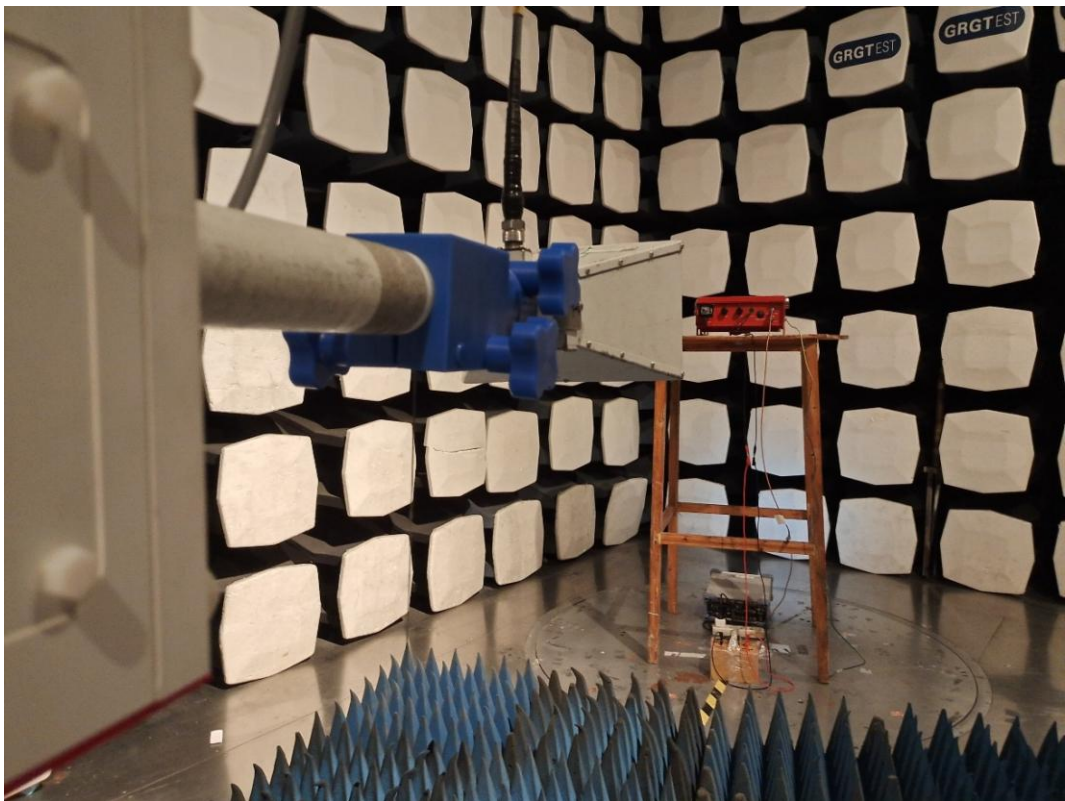
Radiated spurious emissions—Above 1GHz