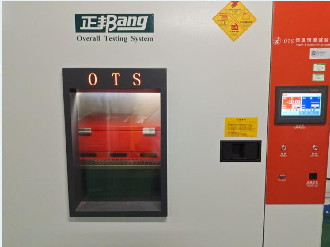
Temperature change test-2