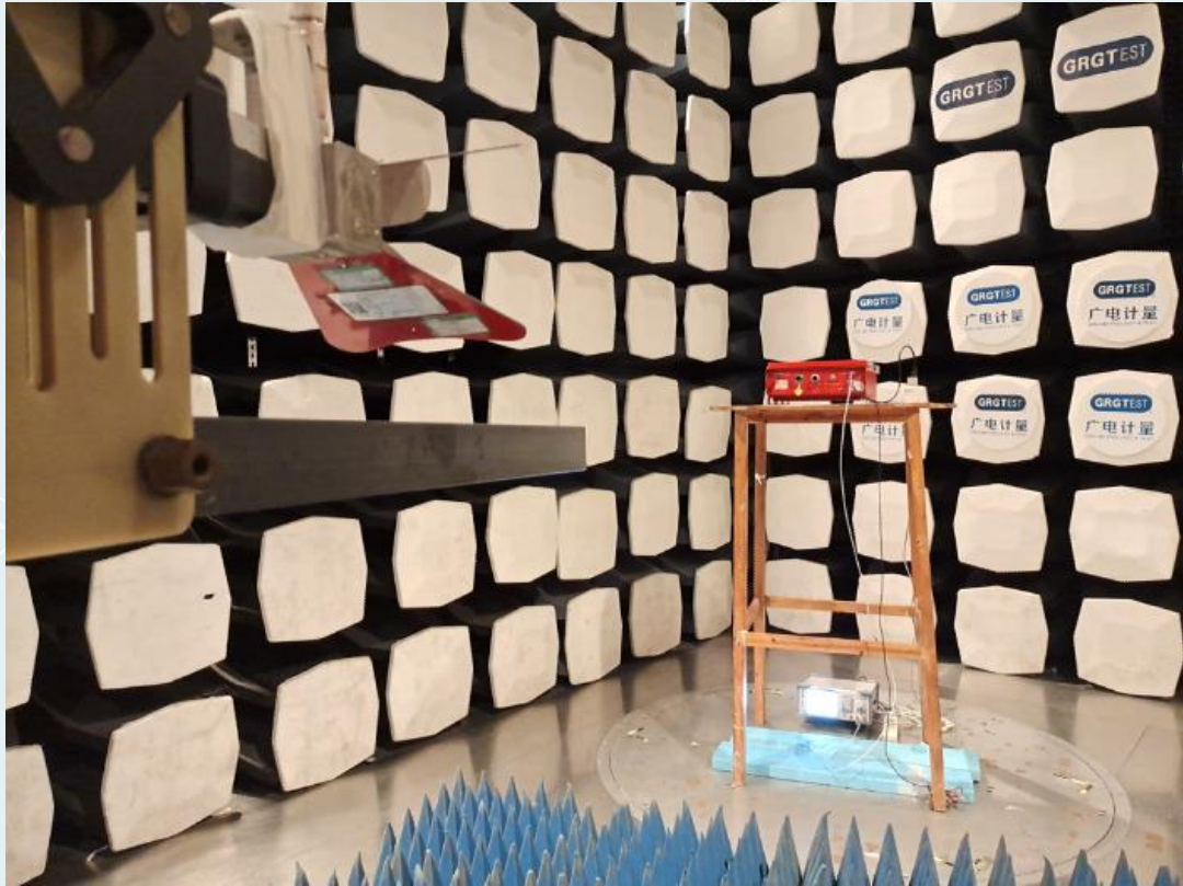
Radiated spurious emissions—Above 1GHz