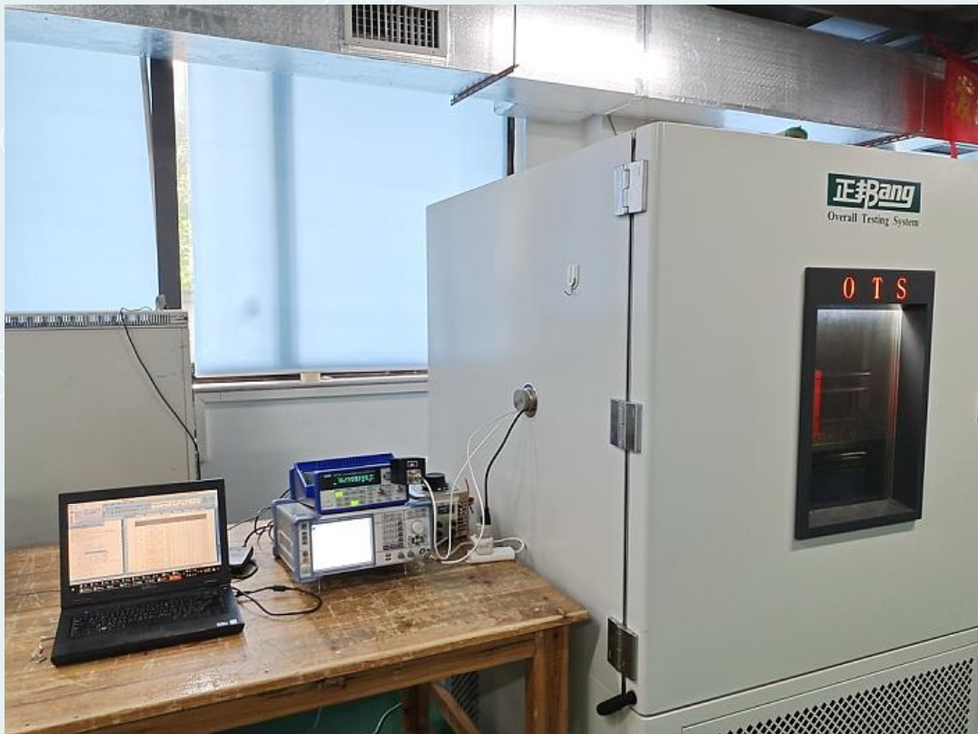
Temperature change test-1