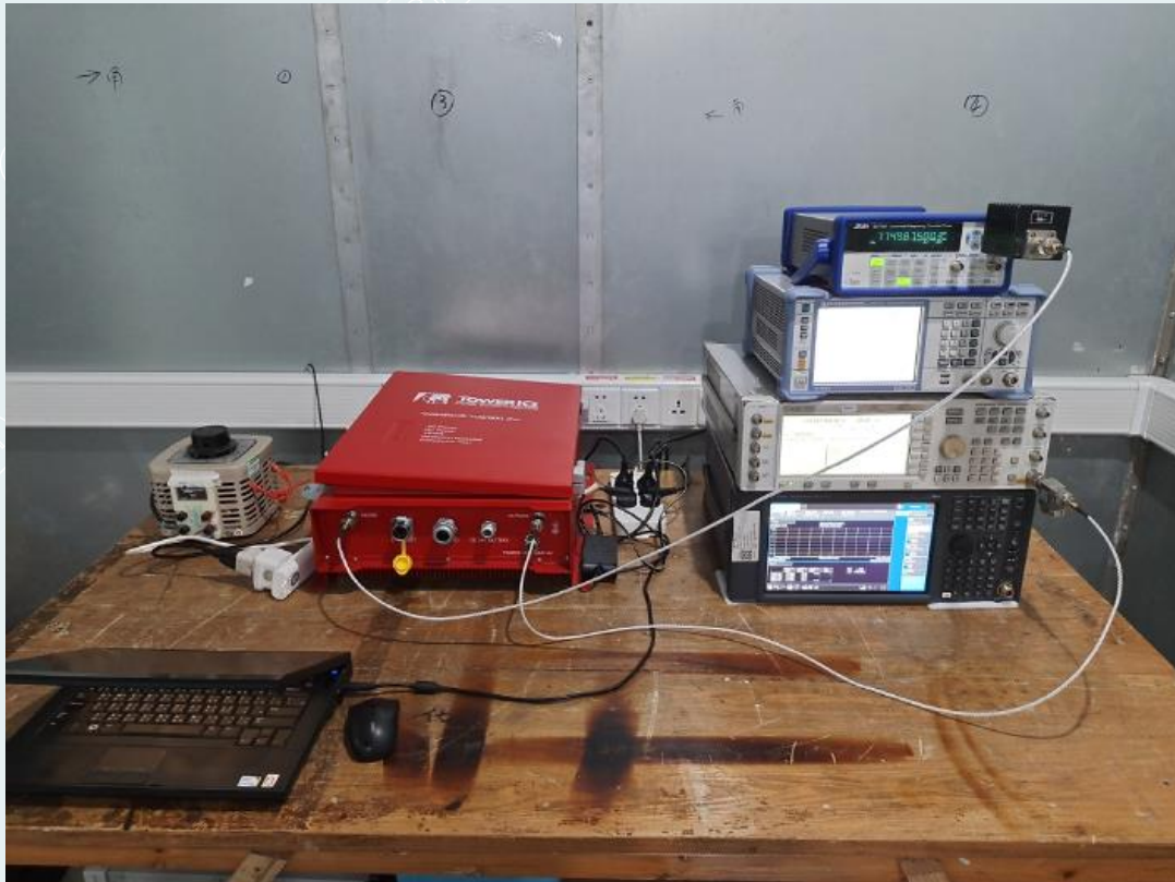
Normal temperature test scenario