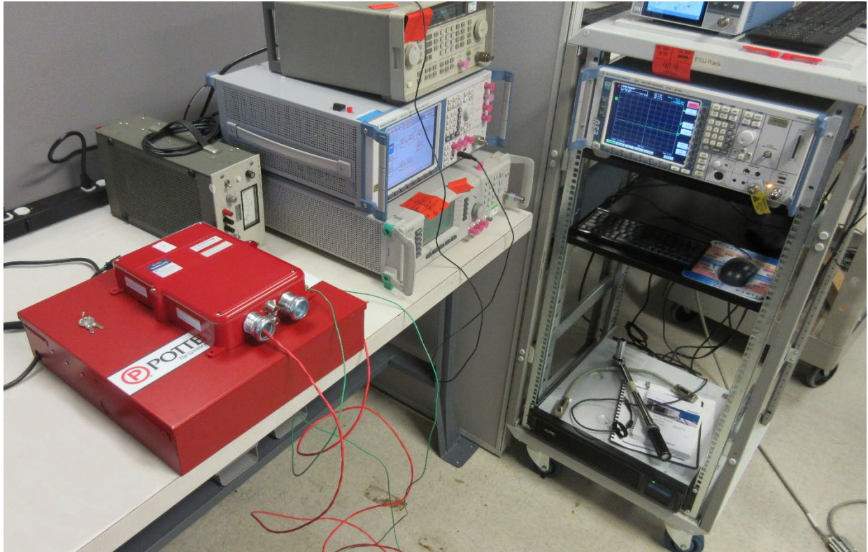
Conducted Test Setup