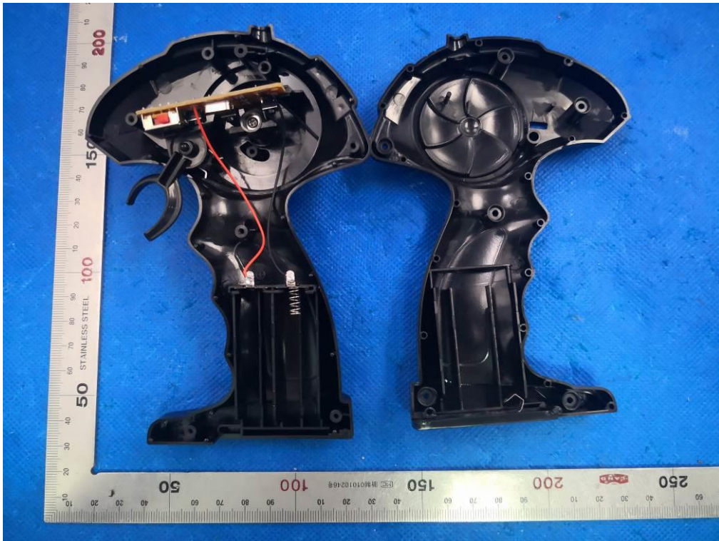
ANTENNA CLOSE-UP PHOTO-1