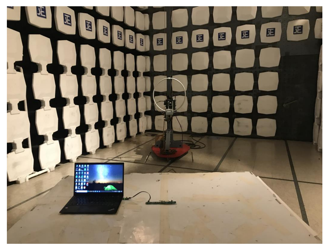
Measurement of Radiated Emission Test Set Up (30MHz to 1000MHz)