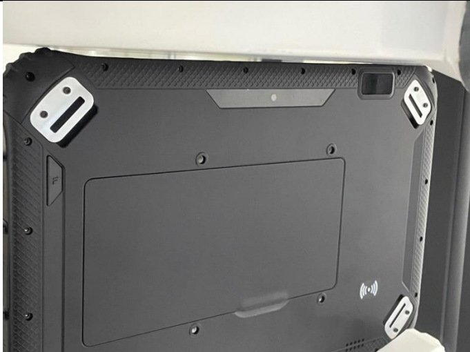
Top Side (Separation distance of 0mm)