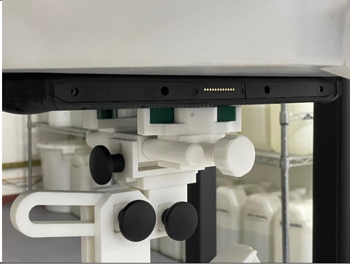
Front Side (Separation distance of 0mm)