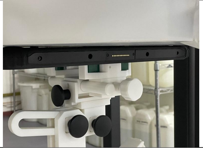
Back Side (Separation distance of 0mm)