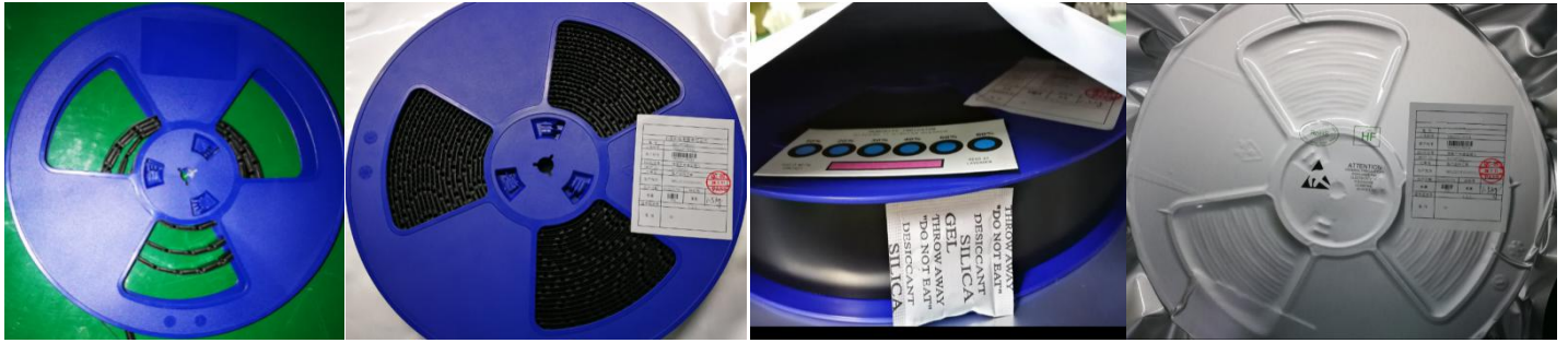
图 4. FLW3881VSA7-A Packing

It is shipped in reel packaging, which is convenient for customers to SMT, built-in humidity card and desiccant, vacuumed in electrostatic bags, and packaged in cartons for shipment. Both the reel and the outer box are affixed with factory notes and check out QR codes for easy tracking .