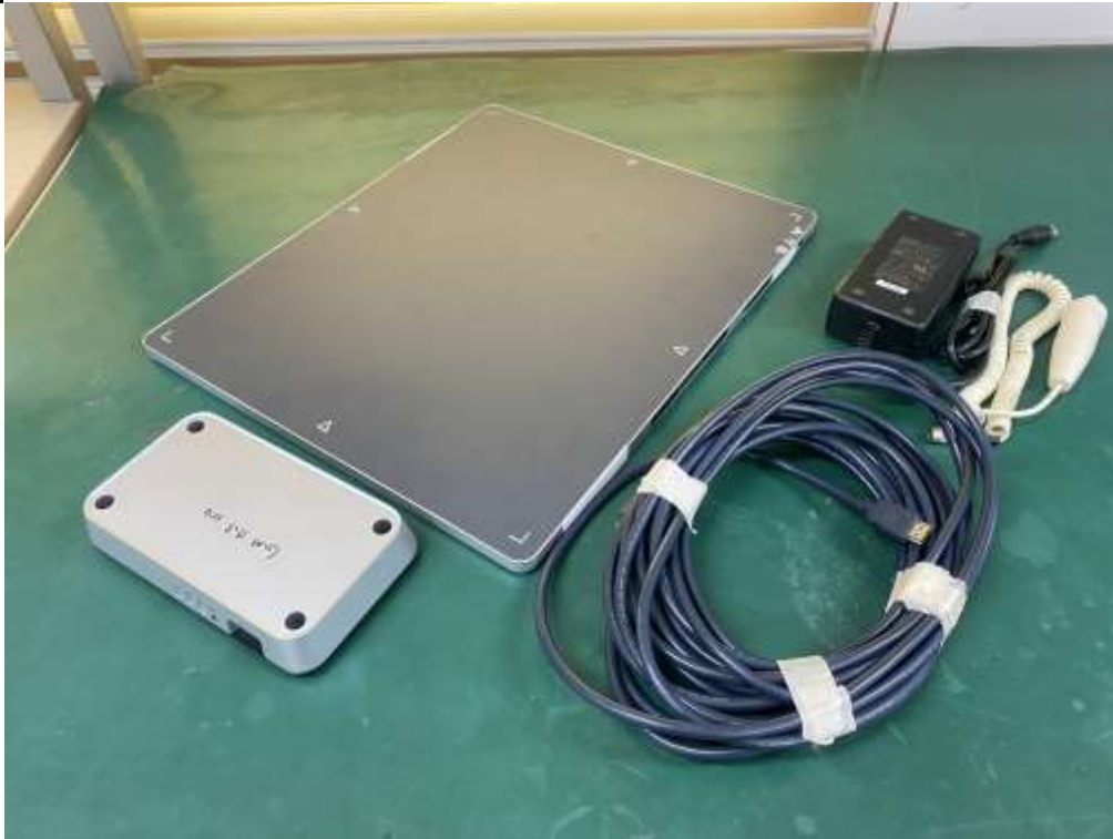
Front Side of EUT