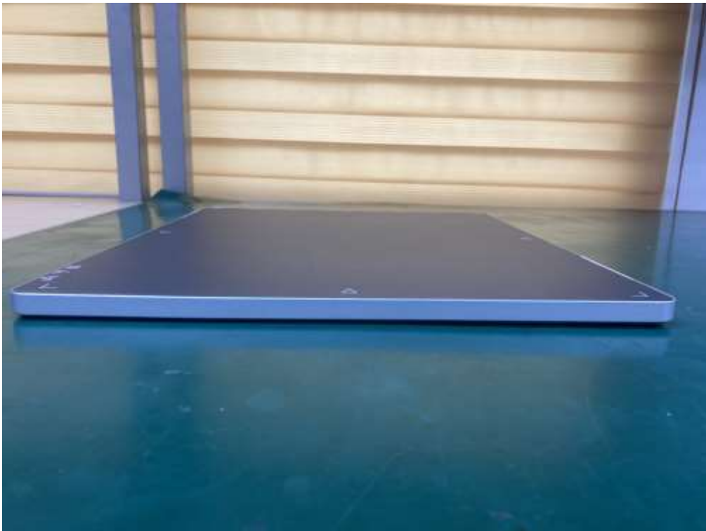
Side of EUT (2)

This report shall not be reproduced except in full, without the written approval of KES Co., Ltd. The results shown in this test report refer only to the sample(s) tested unless otherwise stated. The authenticity of the test report, contact shchoi@kes.co.kr