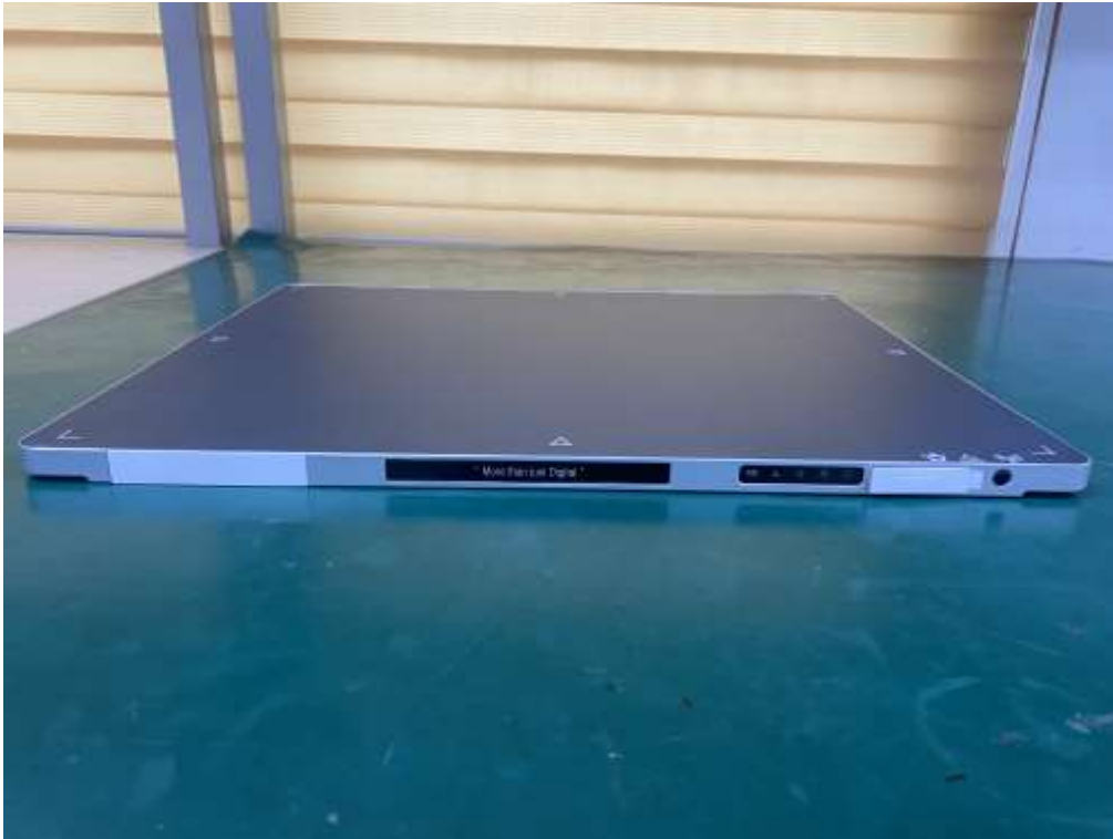
Side of EUT (1)