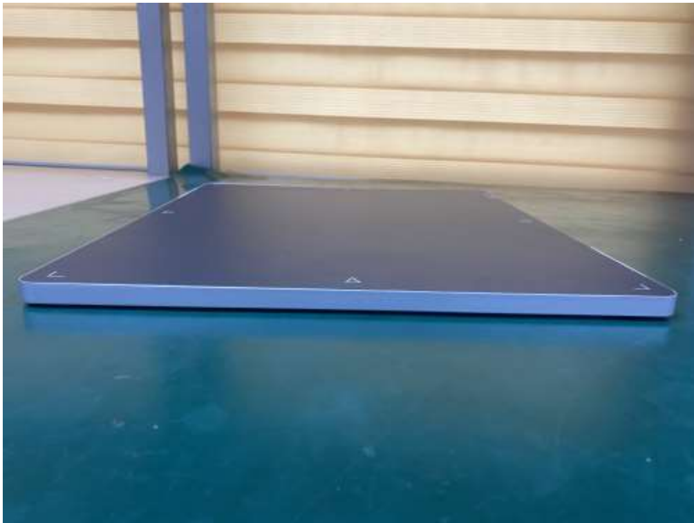
Side of EUT (4)

This report shall not be reproduced except in full, without the written approval of KES Co., Ltd. The results shown in this test report refer only to the sample(s) tested unless otherwise stated. The authenticity of the test report, contact shchoi@kes.co.kr