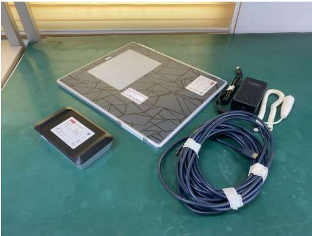
Rear Side of EUT

This report shall not be reproduced except in full, without the written approval of KES Co., Ltd. The results shown in this test report refer only to the sample(s) tested unless otherwise stated. The authenticity of the test report, contact shchoi@kes.co.kr