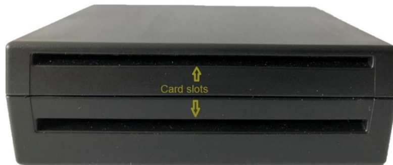
Fig. 4.1 Card slots