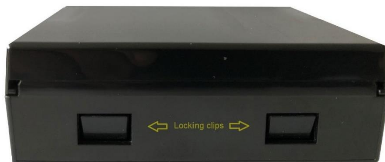
Fig. 5.1 Locking Clips