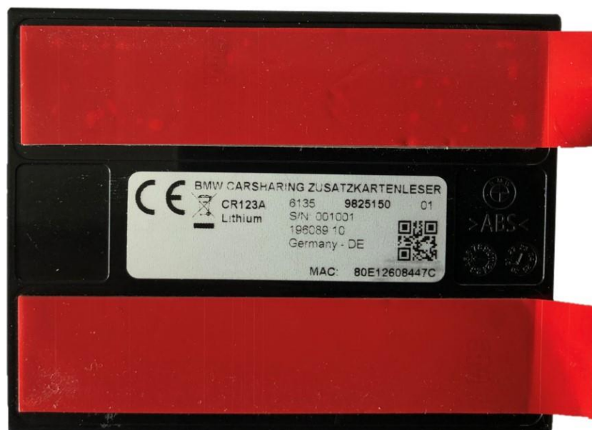
Fig. 5.3 Position adhesive tapes ZKL