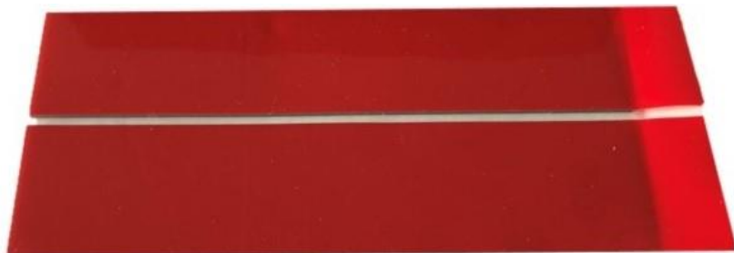
Fig. 3.2 Adhesive tapes