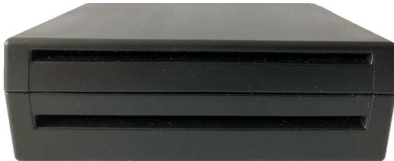
Fig. 3.1 ZKL

The battery CR123A is not part of the scope of supply!