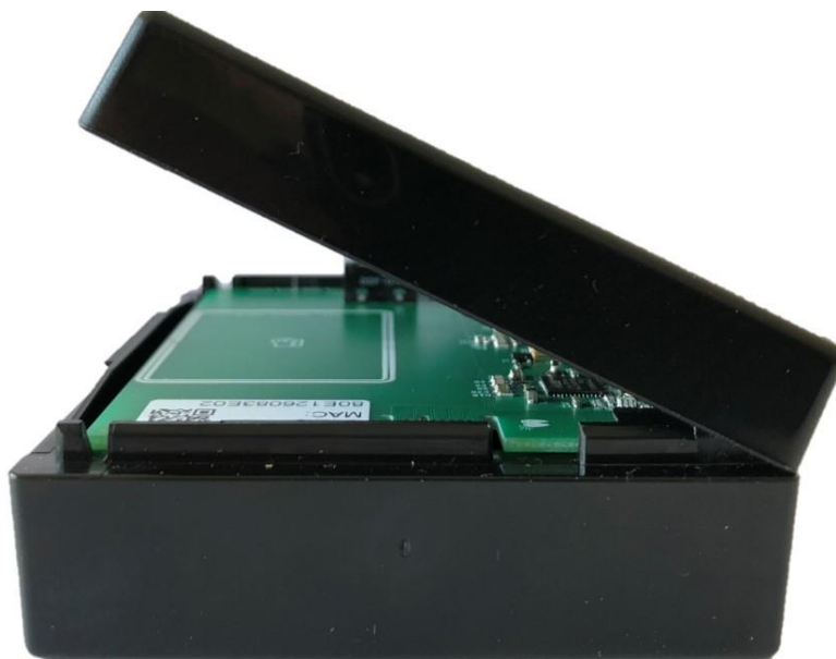
Fig. 5.2 Open housing