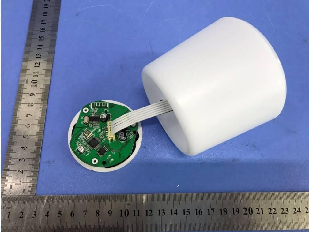
Photo 9 Appearance of Battery