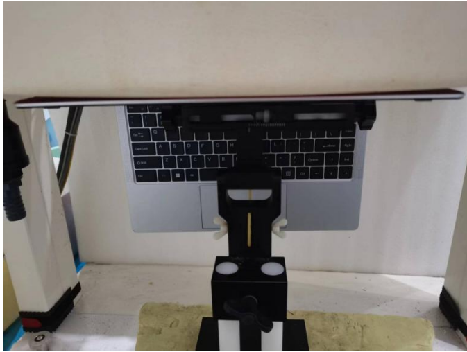
Fig-4.5 Top of EUT with 0 cm Gap (Body Mode)