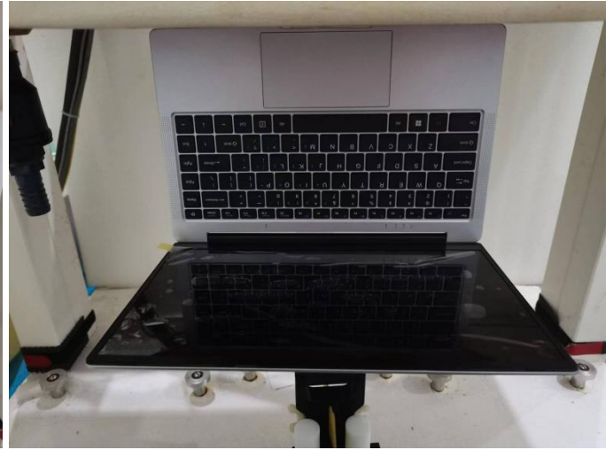
Fig-4.6 Bottom of EUT with 0 cm Gap (Body Mode)