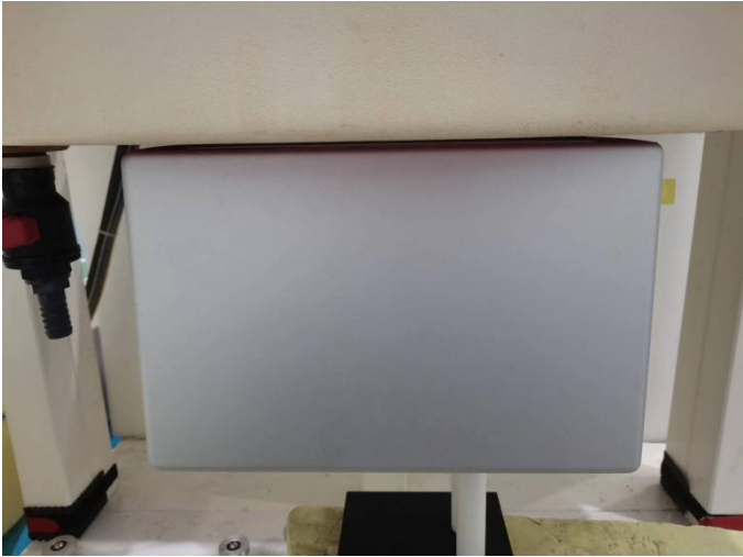
Fig-4.2 Rear Face of EUT with 0 cm Gap (Body Mode)