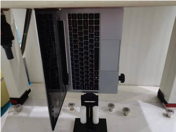
Fig-4.4 Right Side of EUT with 0 cm Gap (Body Mode)