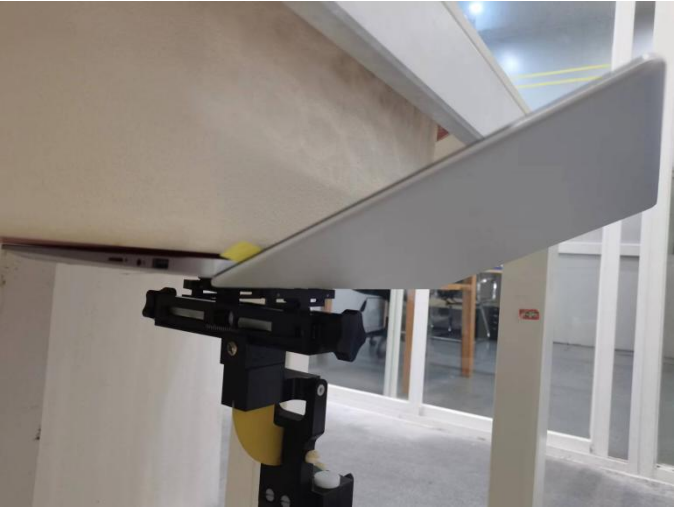
Fig-4.1 Front of EUT with 0 cm Gap (Body Mode)