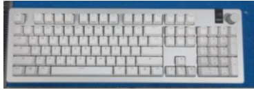
GMMK 3 PRO 100% WIRELESS shell color and keycap