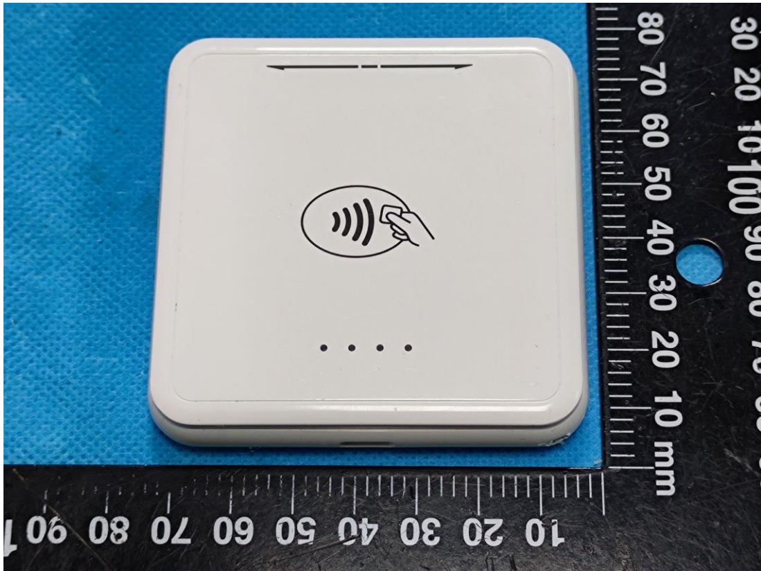
EXHIBIT B - EUT EXTERNAL PHOTOGRAPHS