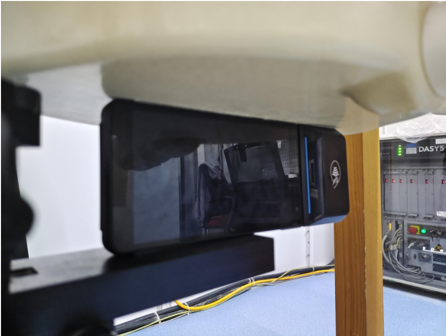
Handheld Right Setup Photo (0mm)