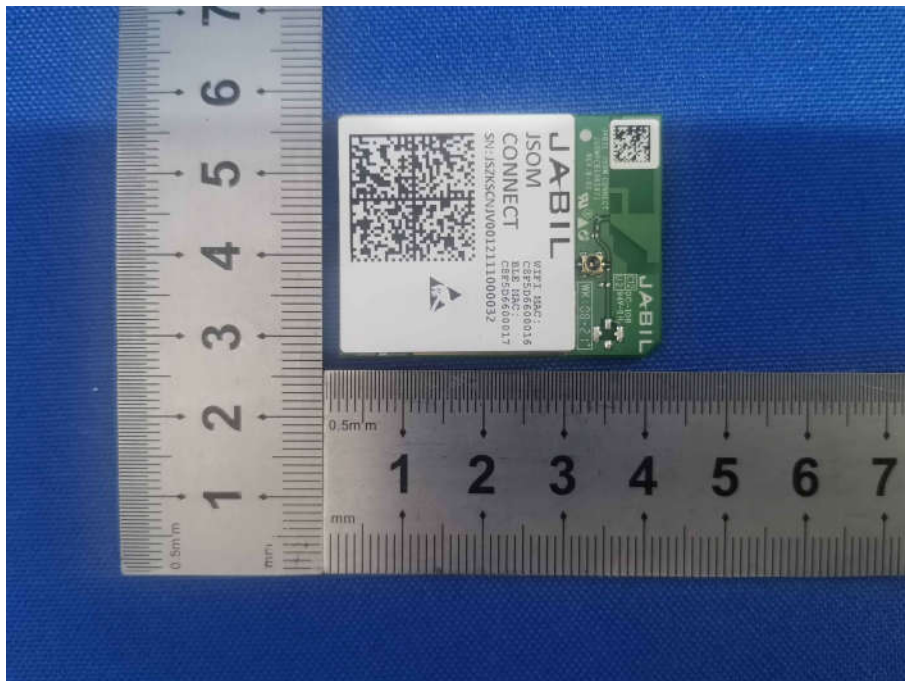
View of Product-1