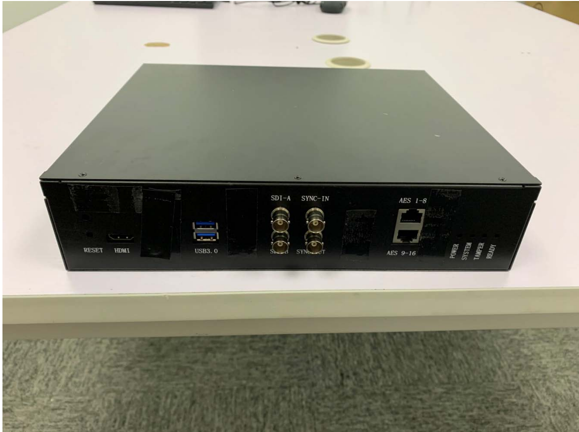
Figure 1 shows an overview of the position of the ports and interfaces on the GM01.