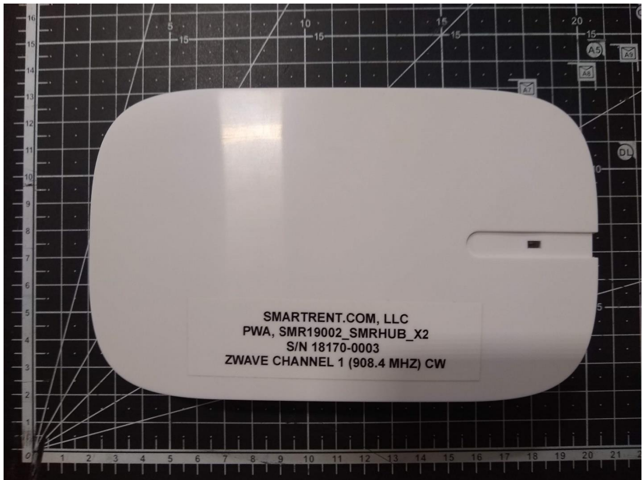
EUT Top View