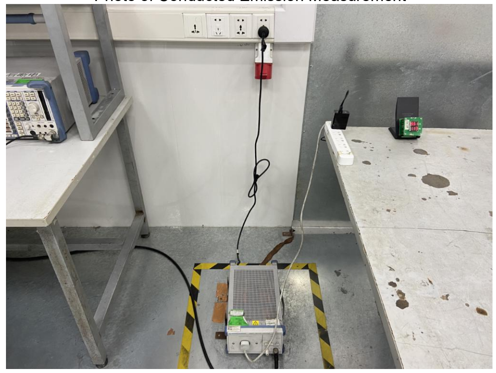
FCC ID: 2AXMG-M220 Photo of Conducted Emission Measurement