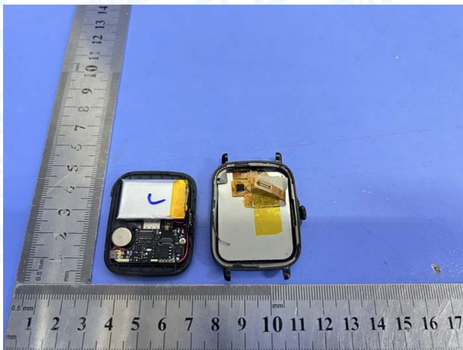
Photo 7 Appearance of PCB