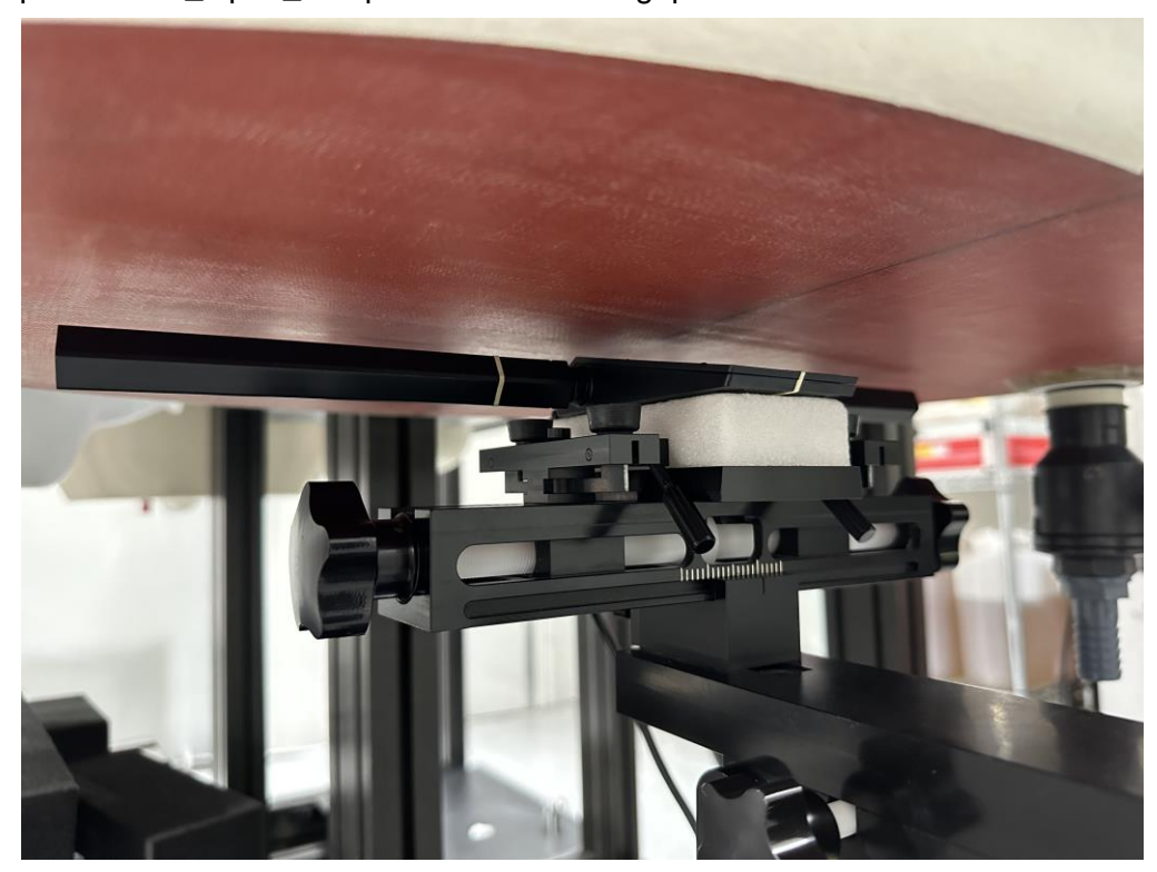
Description: Front_Close_0 position with 5mm gap

Description: Front_Open_180 position with 5mm gap