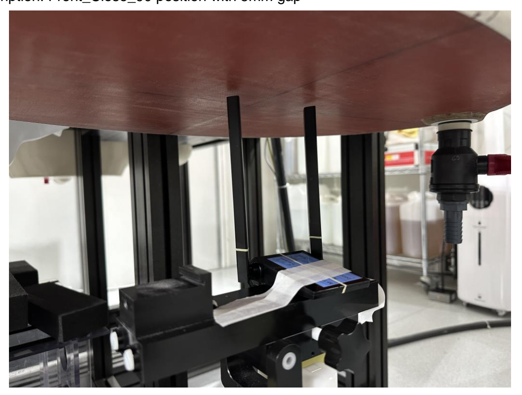
Description: Front_Close_180 position with 5mm gap

Description: Front_Close_90 position with 5mm gap