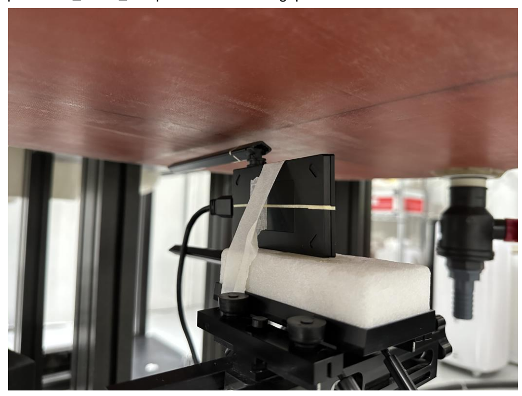
Description: Right_Close_180 position with 5mm gap

Description: Left_Close_180 position with 5mm gap