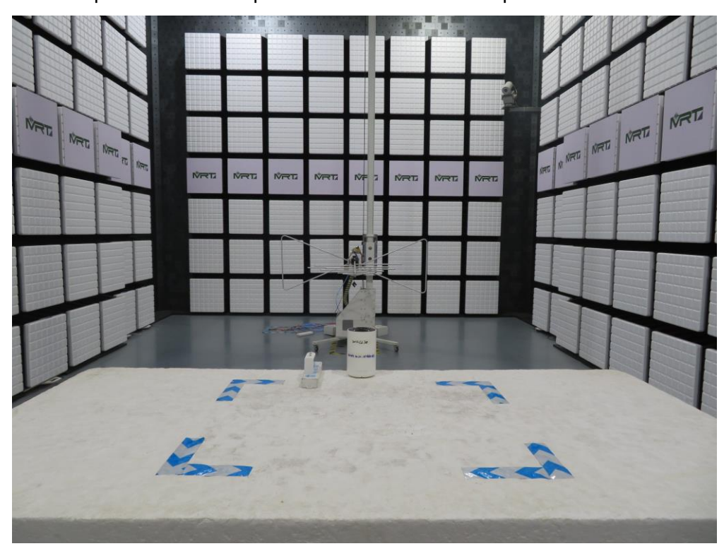
Description: Radiated Spurious Emission Test Setup for Above 1GHz

Description: Radiated Spurious Emission Test Setup for Below 1GHz