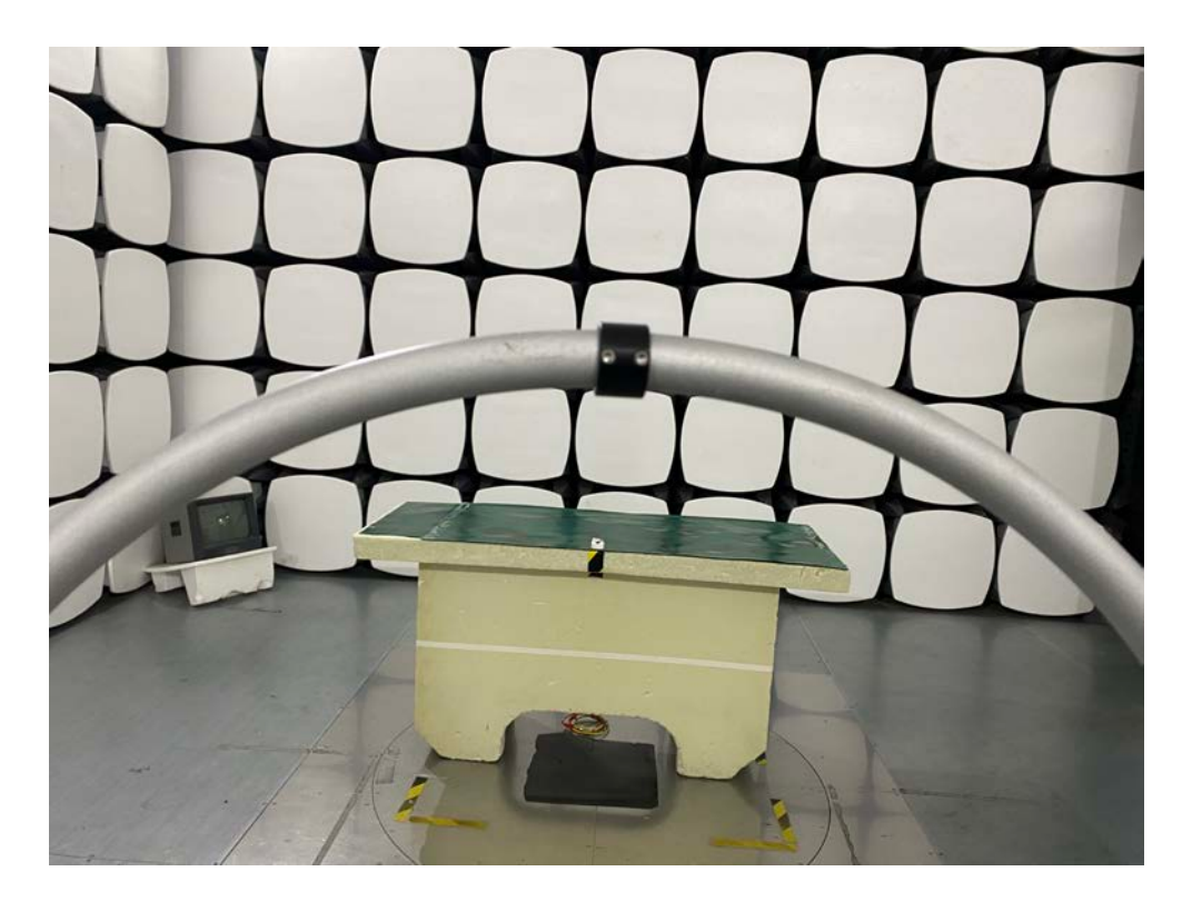
30 MHz to 1 GHz