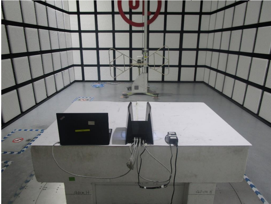
POWERLINE CONDUCTED EMISSIONS MEASUREMENT SETUP