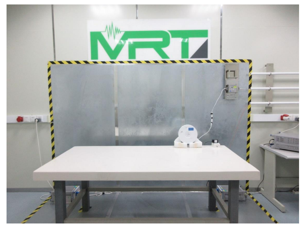
Description: Back View of Conducted Emission Test Setup - 0.15MHz ~ 30MHz