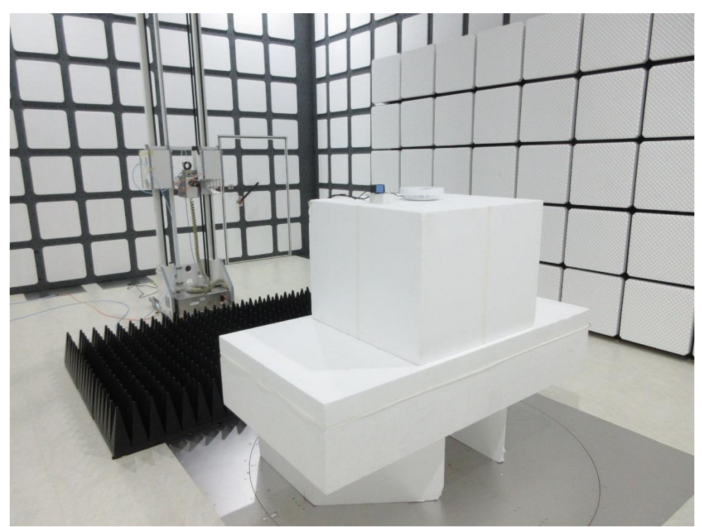
Description: Radiated Emission Test Setup for - 1GHz ~ 18GHz

Description: Radiated Emission Test Setup for - 30MHz ~ 1GHz