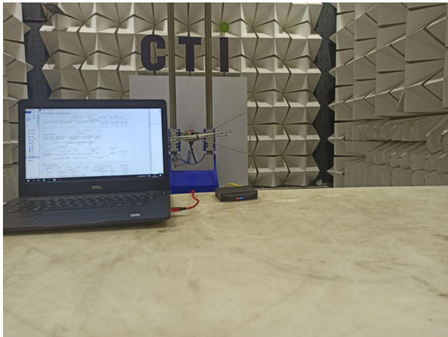
Radiated spurious emission Test Setup-2(Below 1GHz)