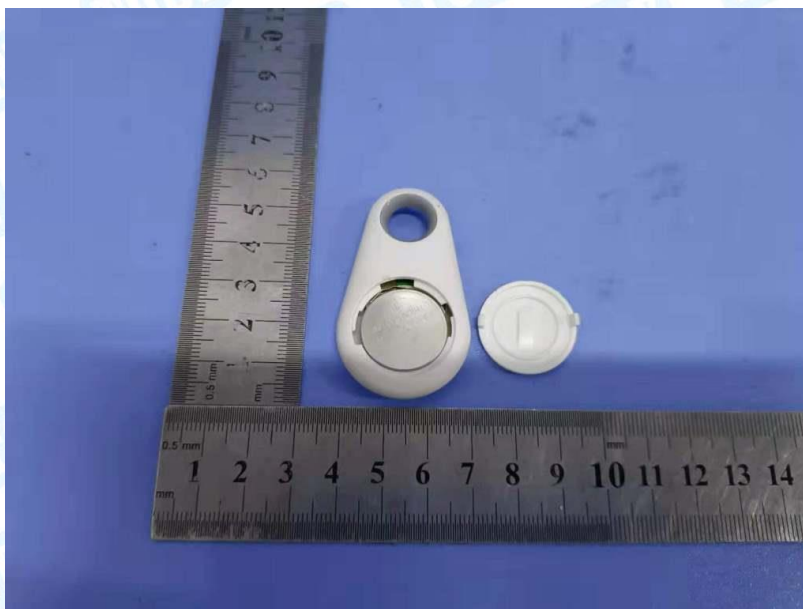
Photo 4 Appearance of Battery