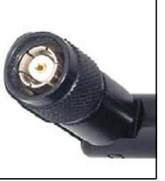
TNC Plug Reverse Polarity (TR)