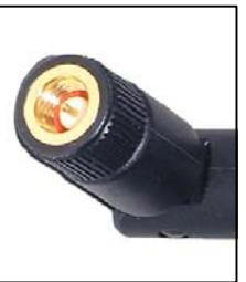
SMA Plug Reverse Thread (AT)