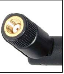
SMA Plug Reverse Polarity (AH)