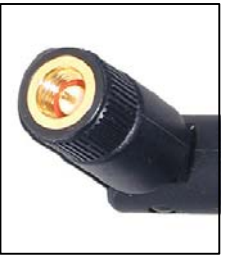
SMA Plug (AM)