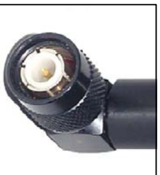
TNC Plug (TC)