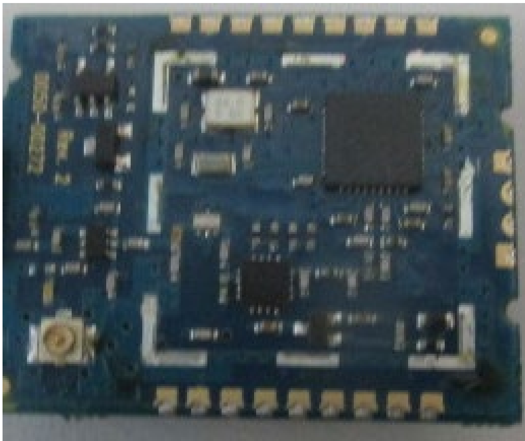
Pluggable Through Hole (312000381)