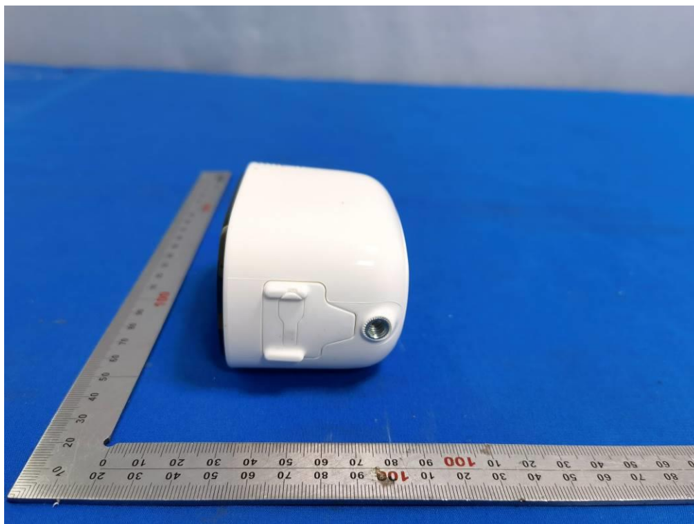
PORT VIEW OF EUT