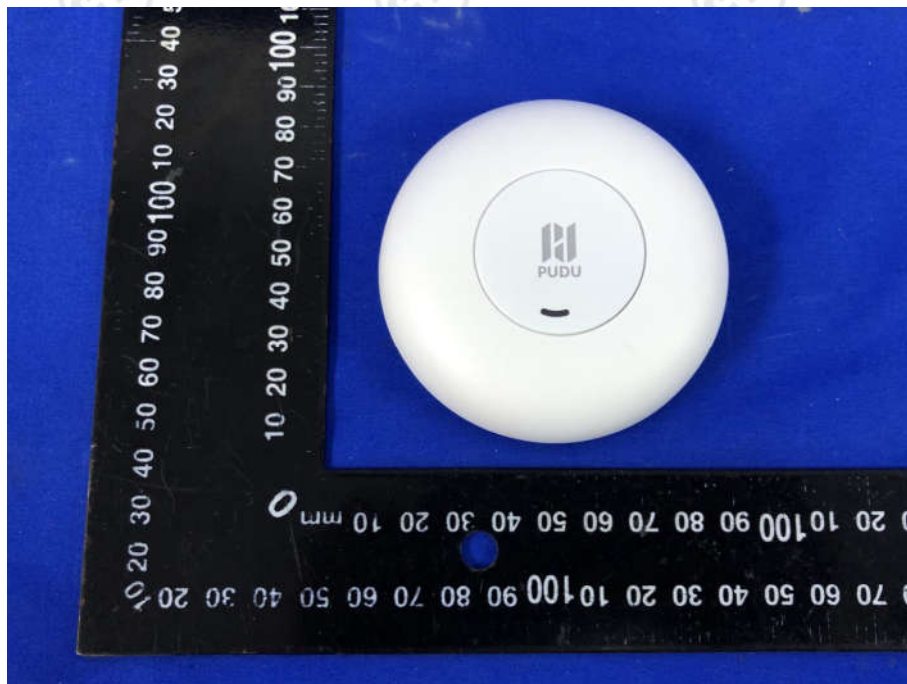
View of Product-2