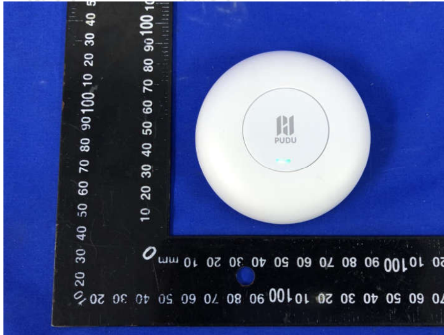
View of Product-1