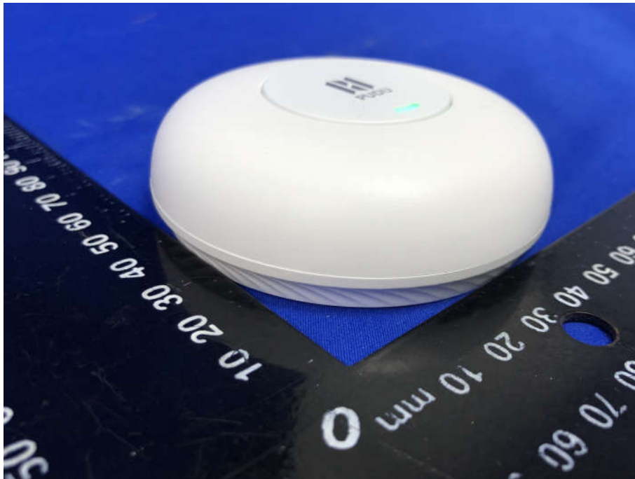
View of Product-4