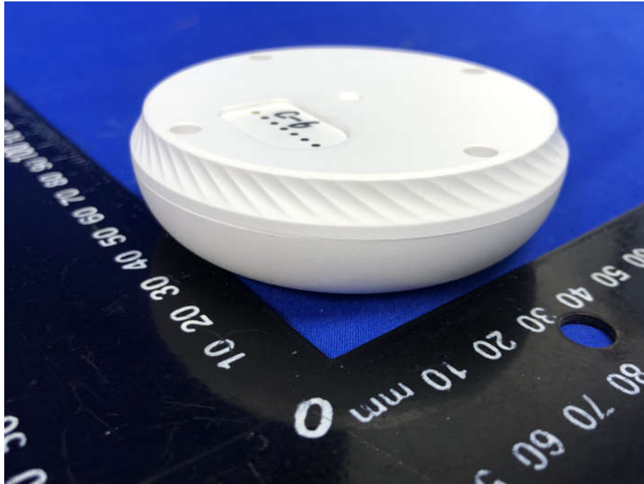
View of Product-5