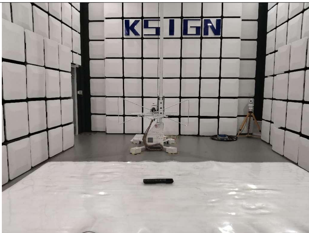
Radiated Measurement (Above 1GHz)